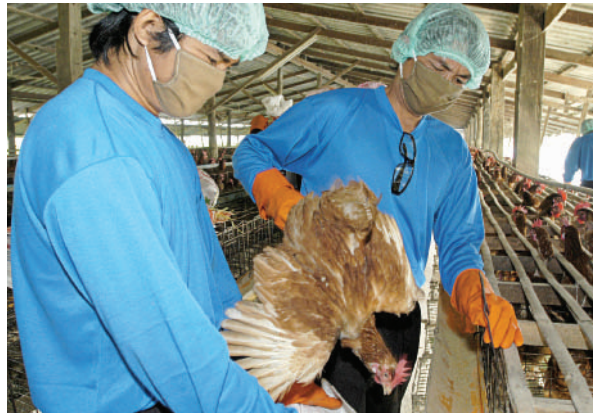
Cutting the links: health officials are culling chickens in a concerted effort to halt the spread of bird flu to humans.

The present outbreak of the highly pathogenic H5N1 virus — named for the